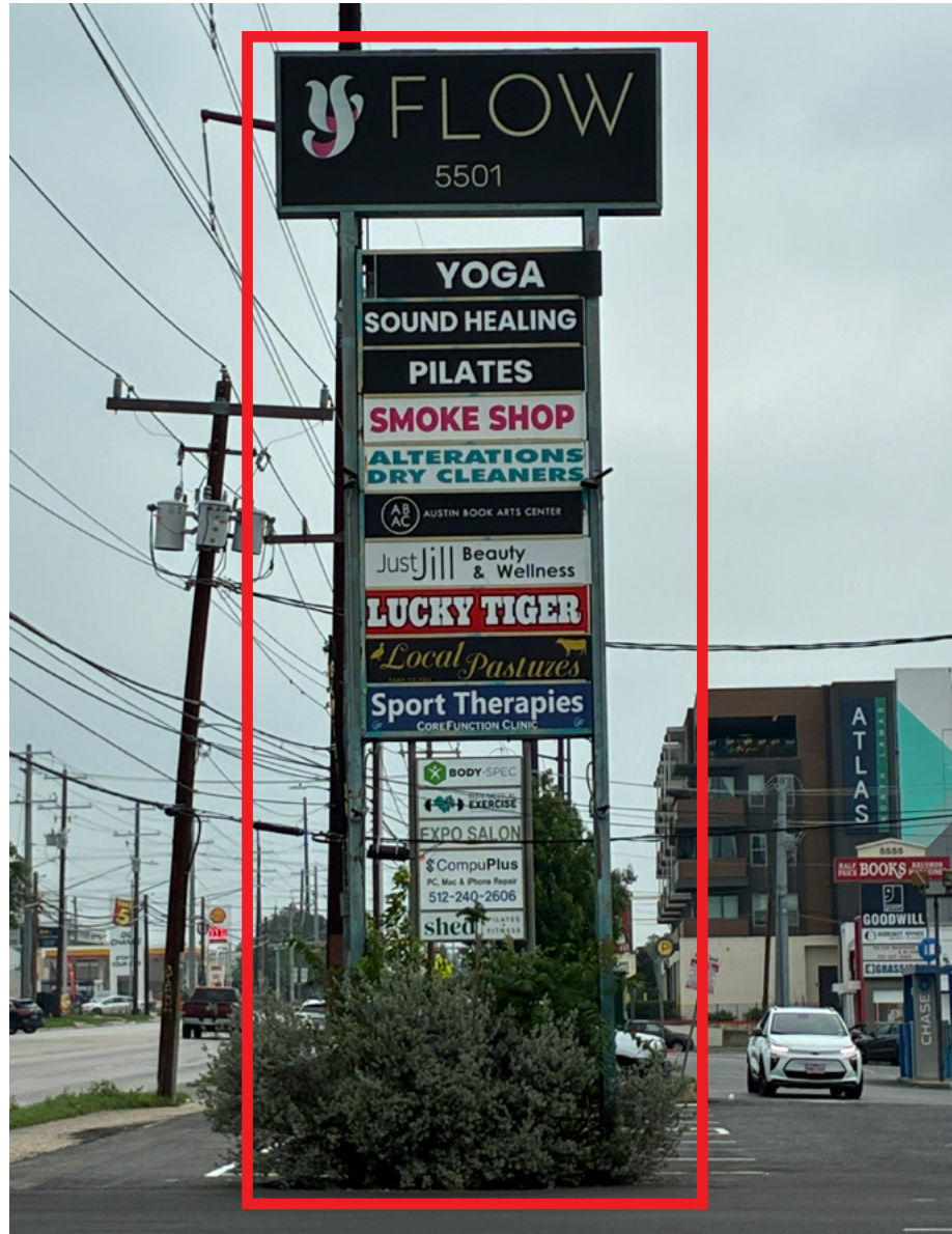
SIGNAGE LOOKING NORTH